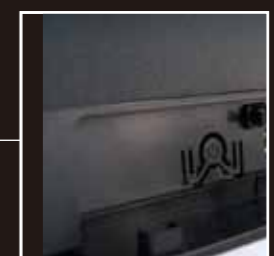
Front access push-open cover for power switch