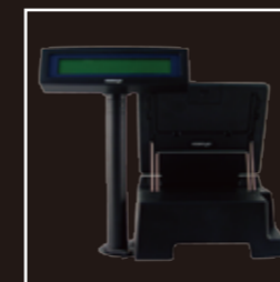
Based mounted customer pole display LCD PD-309 (2 x 20)