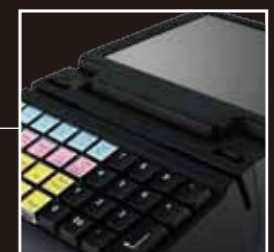
Built-in magnetic stripe reader (MSR)(Optional)