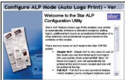
Easy-to-use AutoLogo™ graphics tool able to configure / download up to 15 coupons without any expensive software changes using a simple wizard-driven utility. Load & "ID" a graphic to then trigger a profit-making coupon etc.