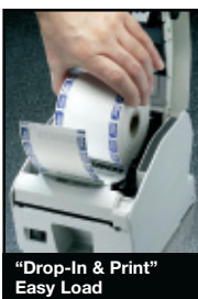
"Drop-In & Print" Easy Load