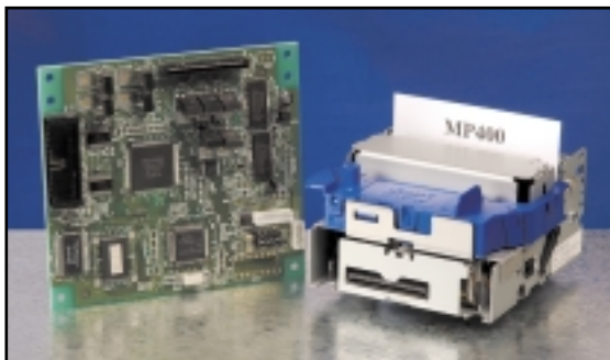
MP400 and Control Board BD100